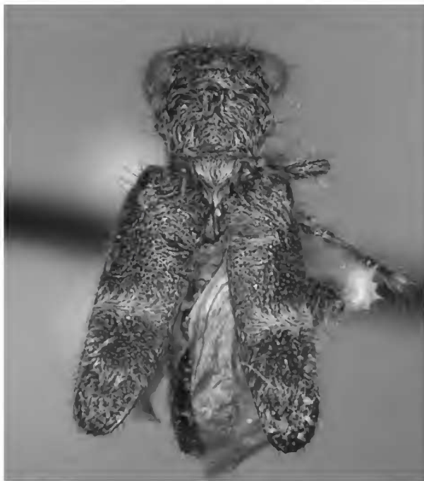
Fig. 3. Phyllobaenus maritimus Wolcott, dorsal habitus. Length 3.6 mm. Specimen is from Turkey Run Park, Fairfax County, Virginia.

Pyticerooides laticornis (Say) – (2); DM, LH; 3–16 Jun, 26 Sep–11 Oct, lf (1).